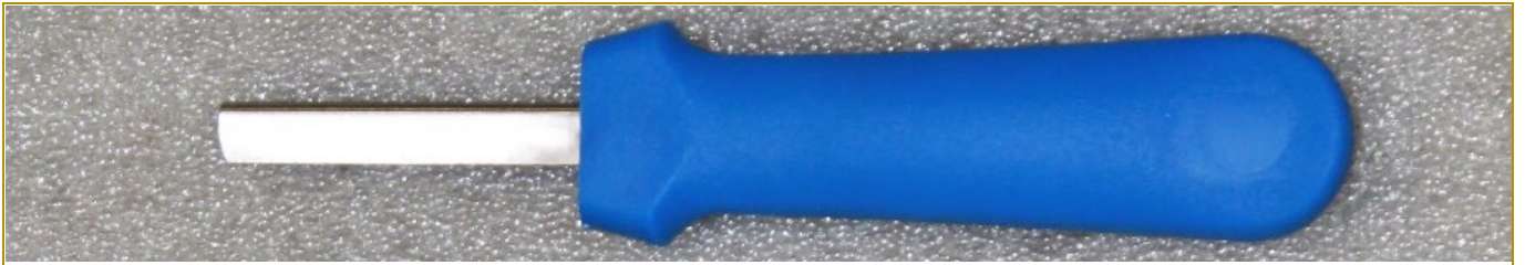
CASING CUTTING KNIFE - BLUE